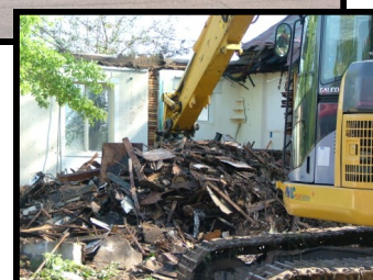
Pictured above: Clearing of property in preparation for the ReStore Annex.