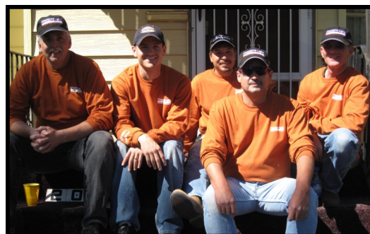
Pictured above: National Day of Service volunteers.

A very special thank you to all of the volunteers who participated in this special event!